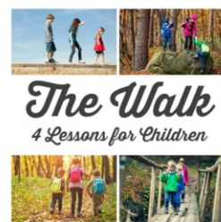
"The Walk" 4 Week Study on Following Jesus $29 $45