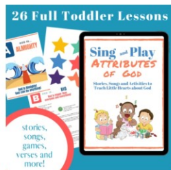
The Ultimate Toddler Bundle: Everything you need to teach age 1-3 about God