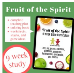
"The Fruit of the Spirit" 9 Unit Curriculum for Kids $57 $90