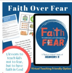
"Faith Over Fear" 5 Lesson Unit for Back-To-School from Hebrews 11 $55