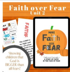
More FAITH Less FEAR: 4-Week Children's Ministry Curriculum (Unit 2 of Faith over Fear) $45