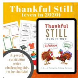
Thankful Still (even in 2020) 4-Week Sunday School Curriculum $45

If your church buys resources, please consider using The Sunday School Store . Church budgets are tight. That's why our digital curriculum is half the cost of printed material. Even when finances are limited, your teaching can make an eternal difference.