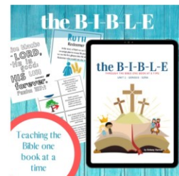
The BIBLE Unit 1: Genesis to Ezra (13 Week Curriculum) from $97 $125