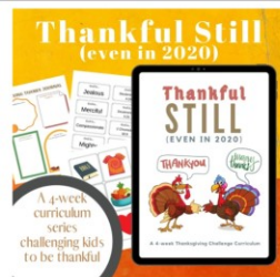
Thankful Still (even in 2020) 4-Week Sunday School Curriculum $45

If your church buys resources, please consider using The Sunday School Store . Church budgets are tight. That's why our digital curriculum is half the cost of printed material. Even when finances are limited, your teaching can make an eternal difference.