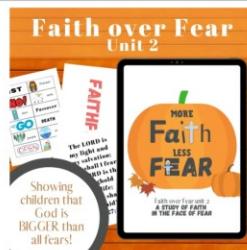
More FAITH Less FEAR: 4-Week Children's Ministry Curriculum (Unit 2 of Faith over Fear) $45