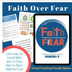
"Faith Over Fear" 5 Lesson Unit for Back-To-School from Hebrews 11 $55